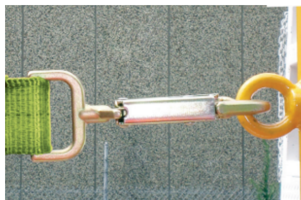
End Post Connection